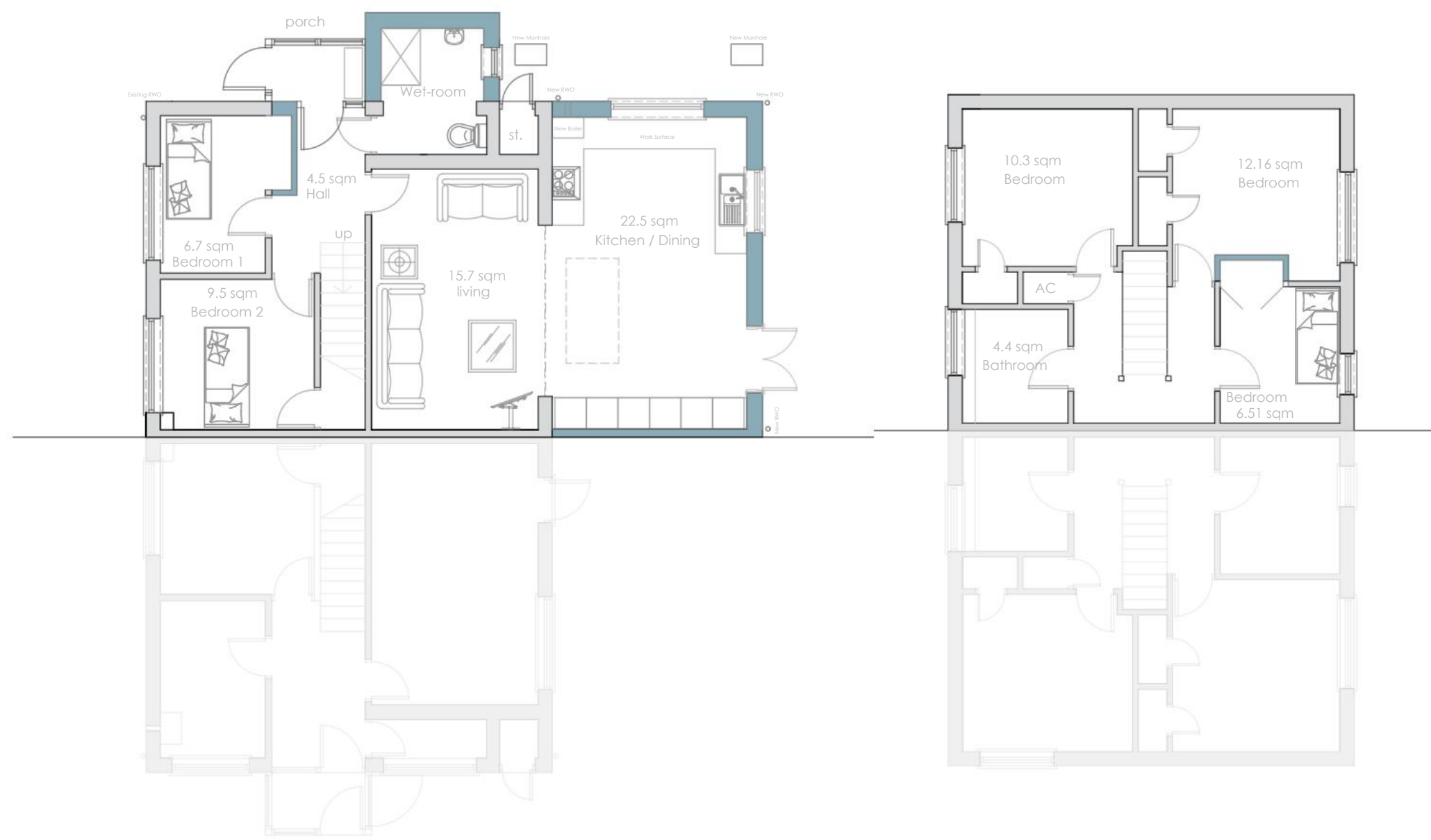
Proposed Ground Floor Plan at 1:100 Scale