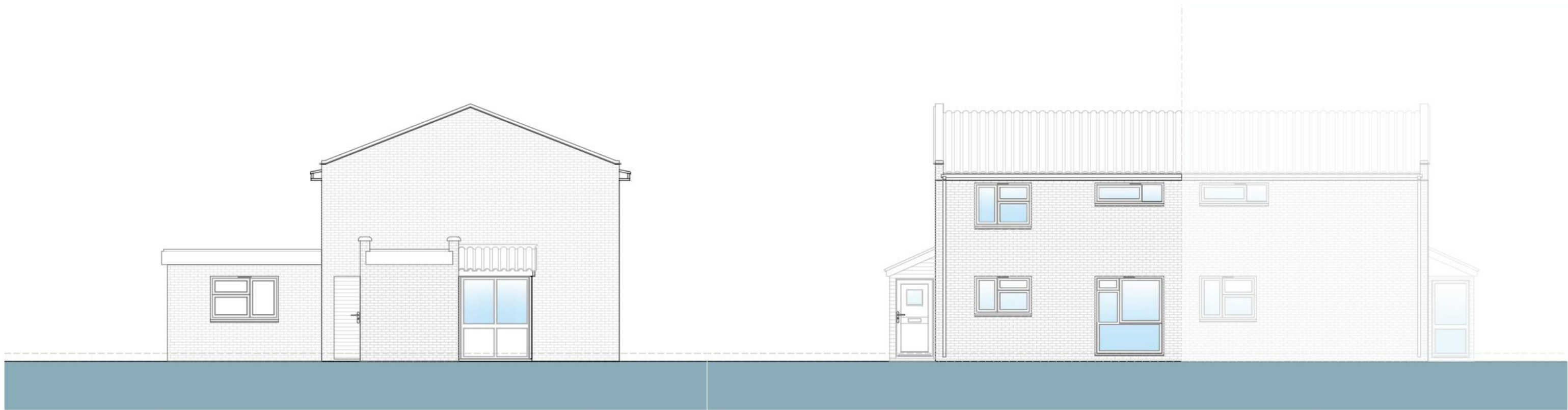
Proposed Side Elevation at 1:100 Scale