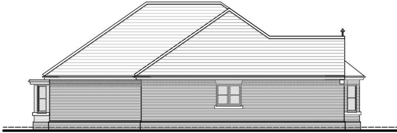
Side Elevation ( facing north east ) Scale 1:100