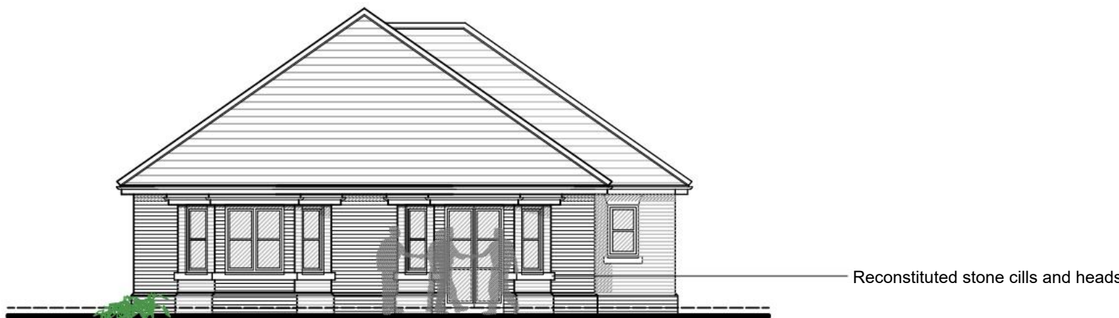
Rear Elevation ( facing south east ) Scale 1:100