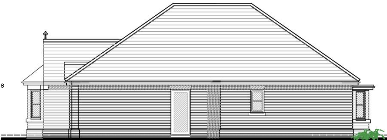
Side Elevation ( facing south west ) Scale 1:100