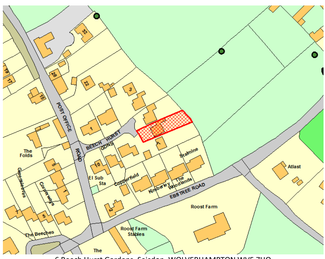
6 Beech Hurst Gardens, Seisdon, WOLVERHAMPTON WV5 7HQ