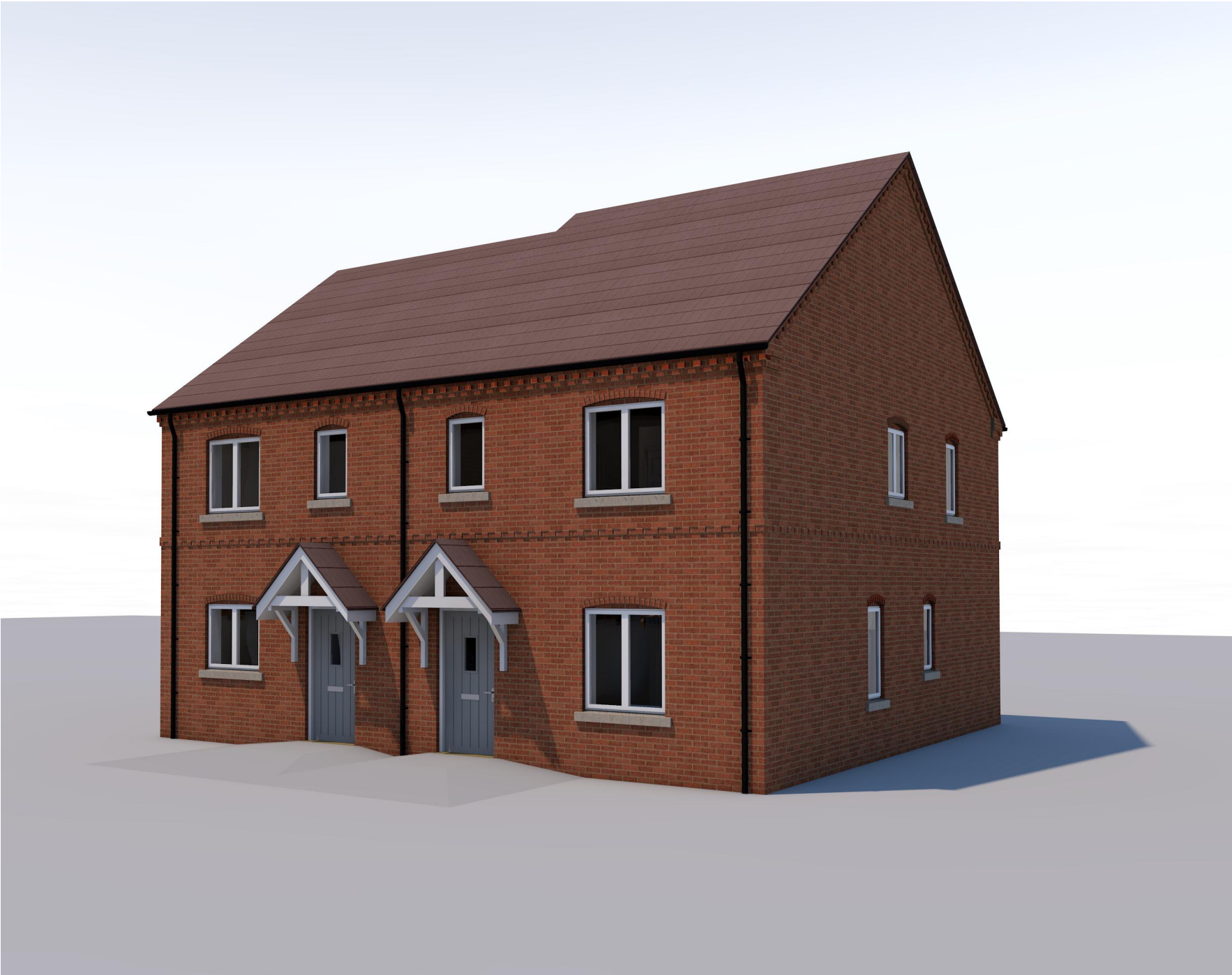
3 D VIEW 2

Roof Brown concrete interlocking roof tiles Marley Ashmore, Forticrete Gemini or similar - manufacturers details tbc