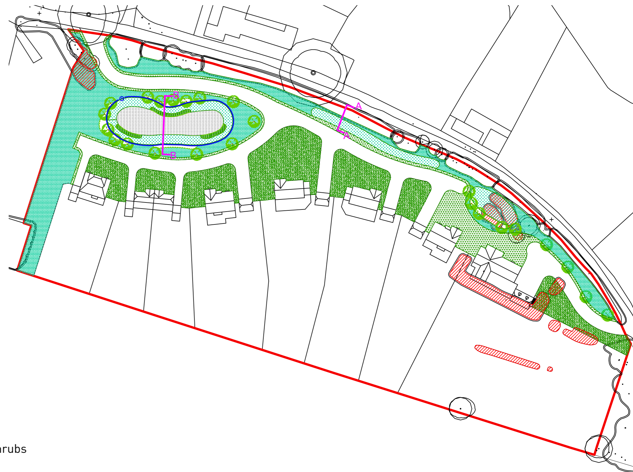
Section Location Plan scale: 1:1000@A2

A- [28/08/2020 JZA] Updated to amended swale location Revisions: First Issue- 24/08/2020 JZA