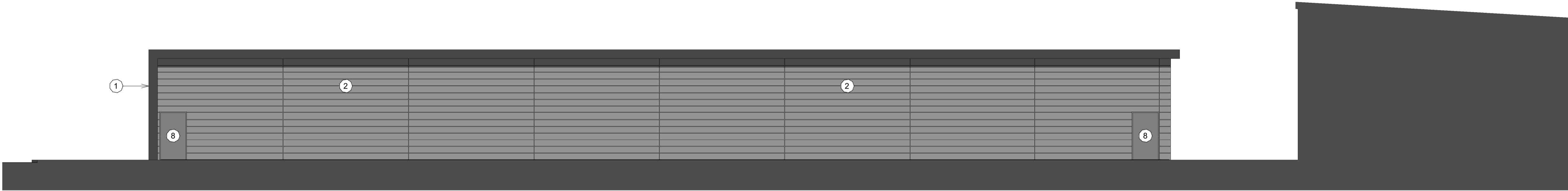
2 Rear Elevation 1 : 100