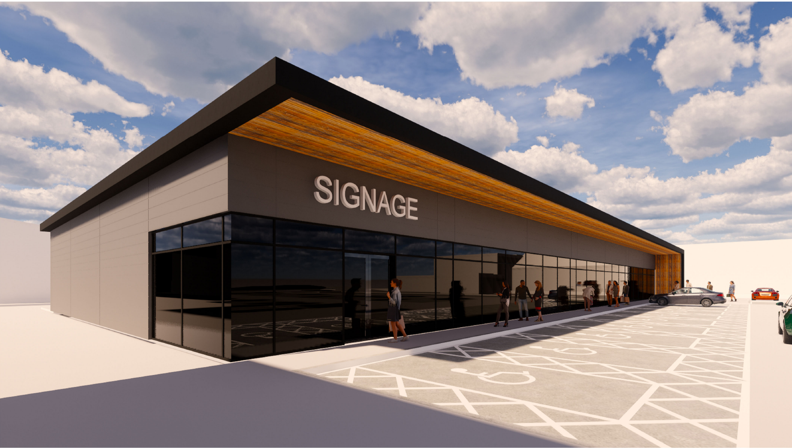
Visual of North- East Approach