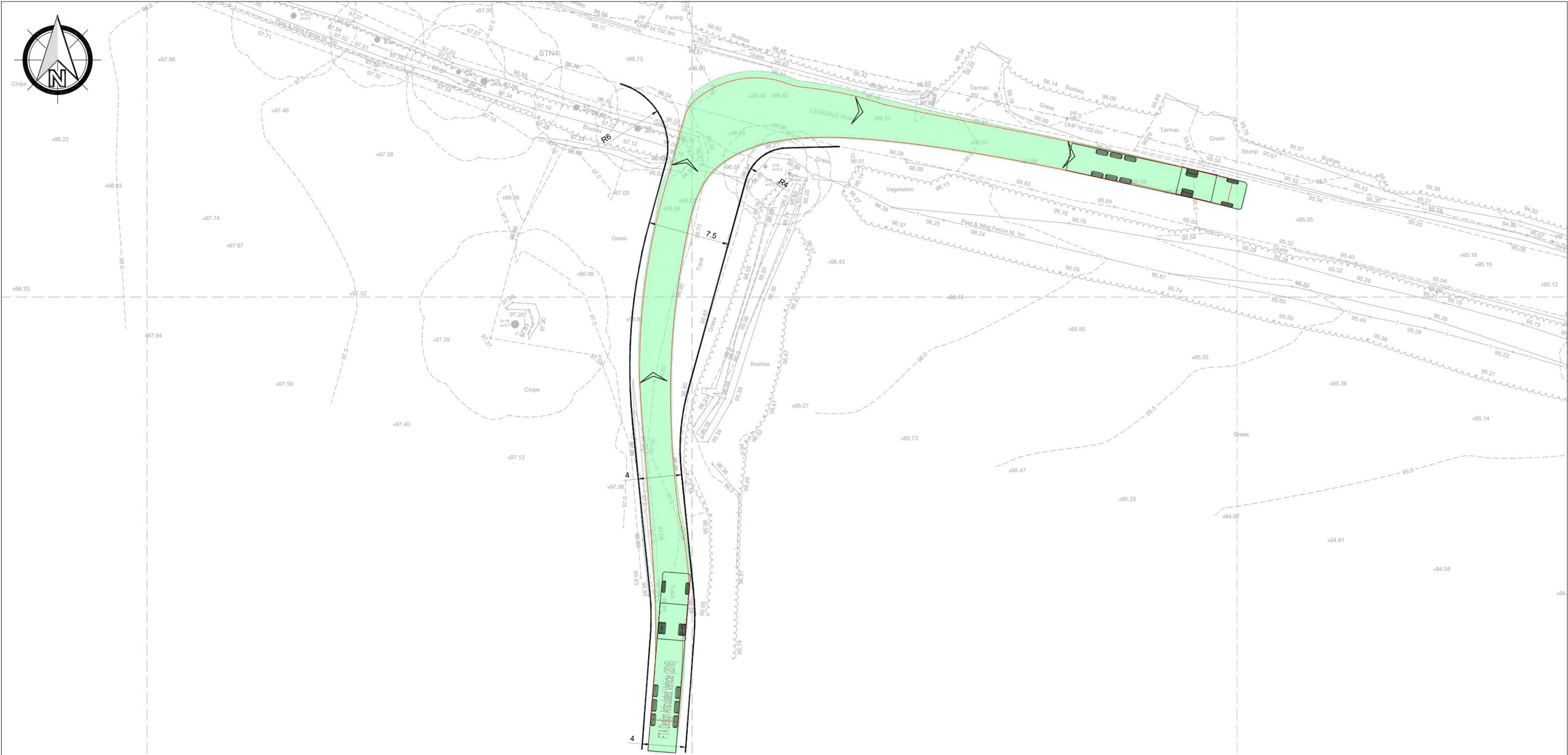
EXIT - EASTBOUND

SCALE 1:250m SCALE BAR FOR INFORMATION ONLY