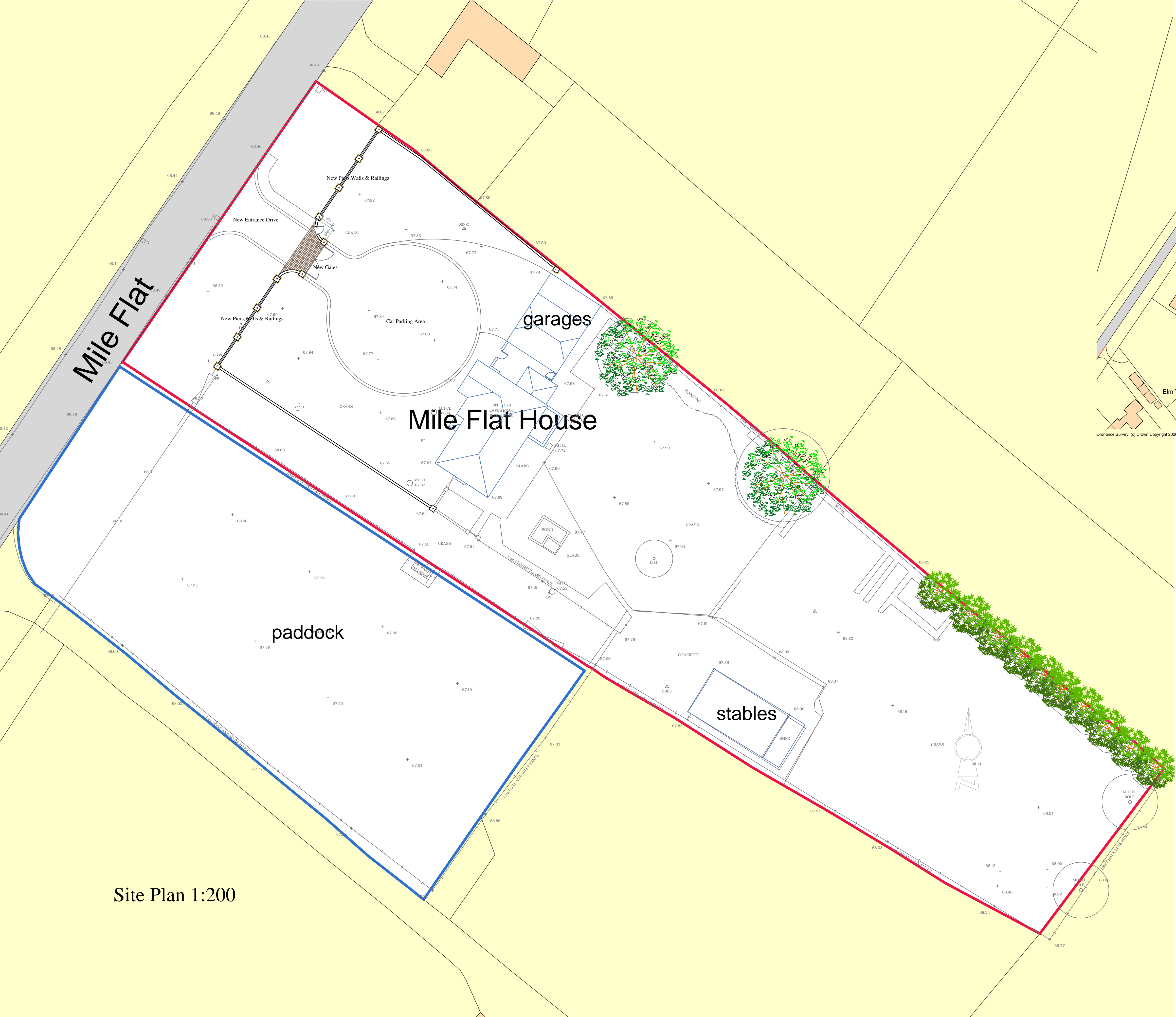
Site Plan 1:200