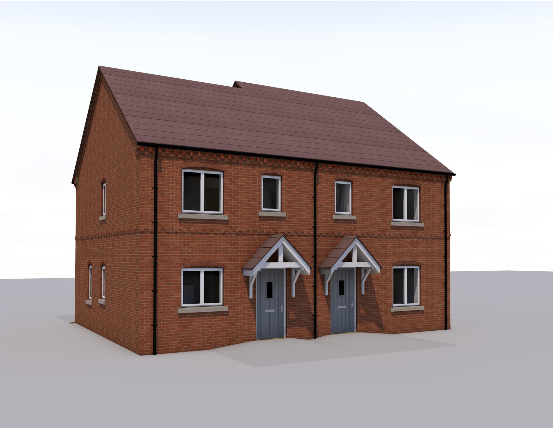
3 D VIEW