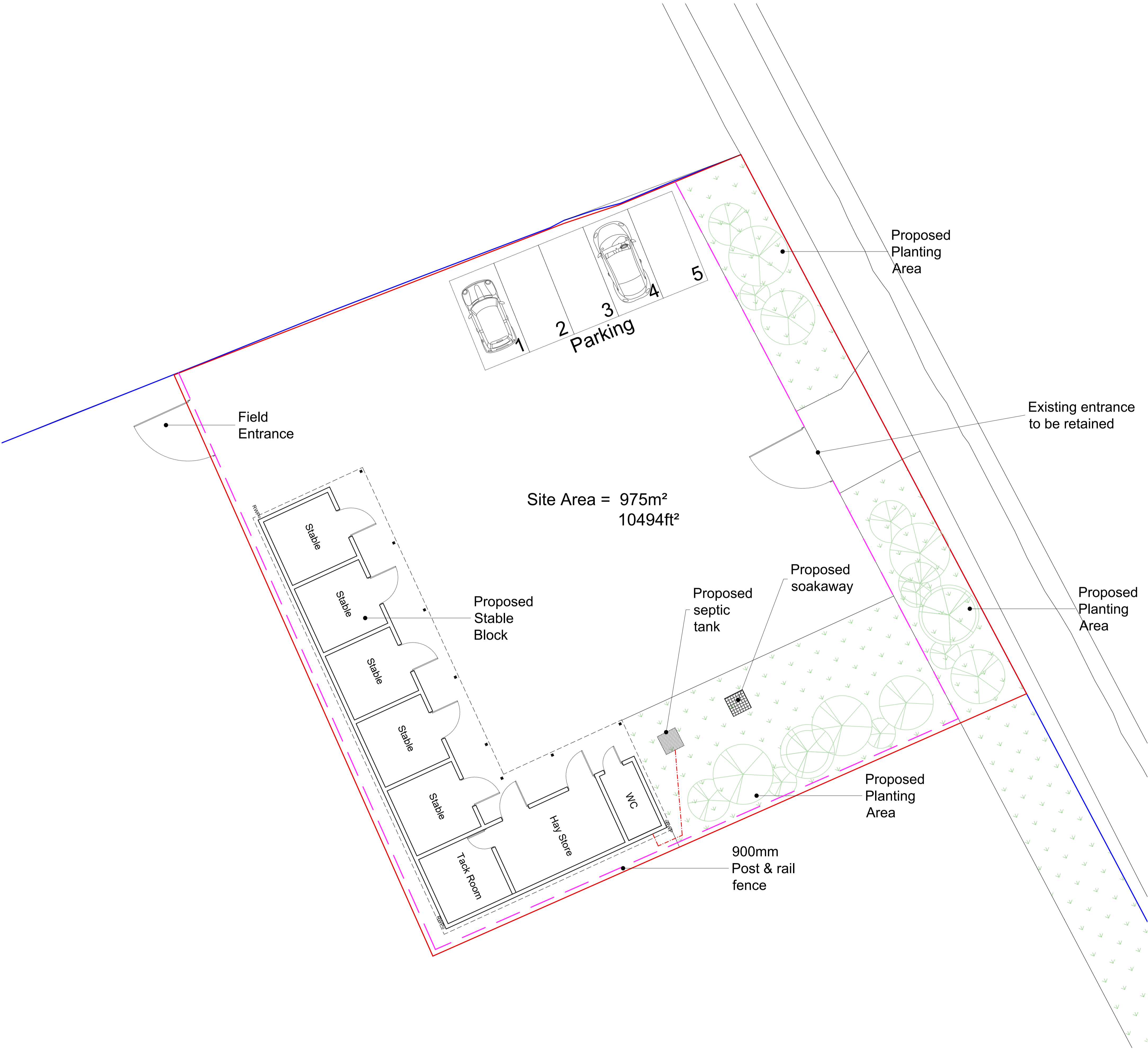
1 Proposed Site Plan 1:100