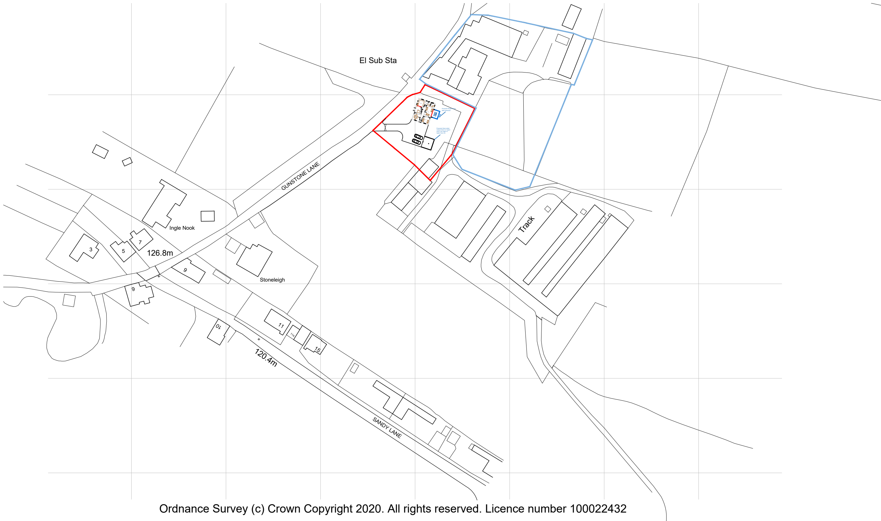
Proposed Site Plan 1:1250 Scale