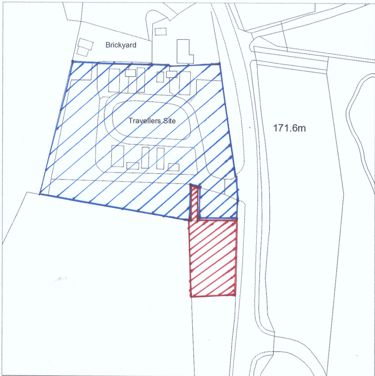
Brickyard Cottage, Bursnips Road, Essington, Wolverhampton