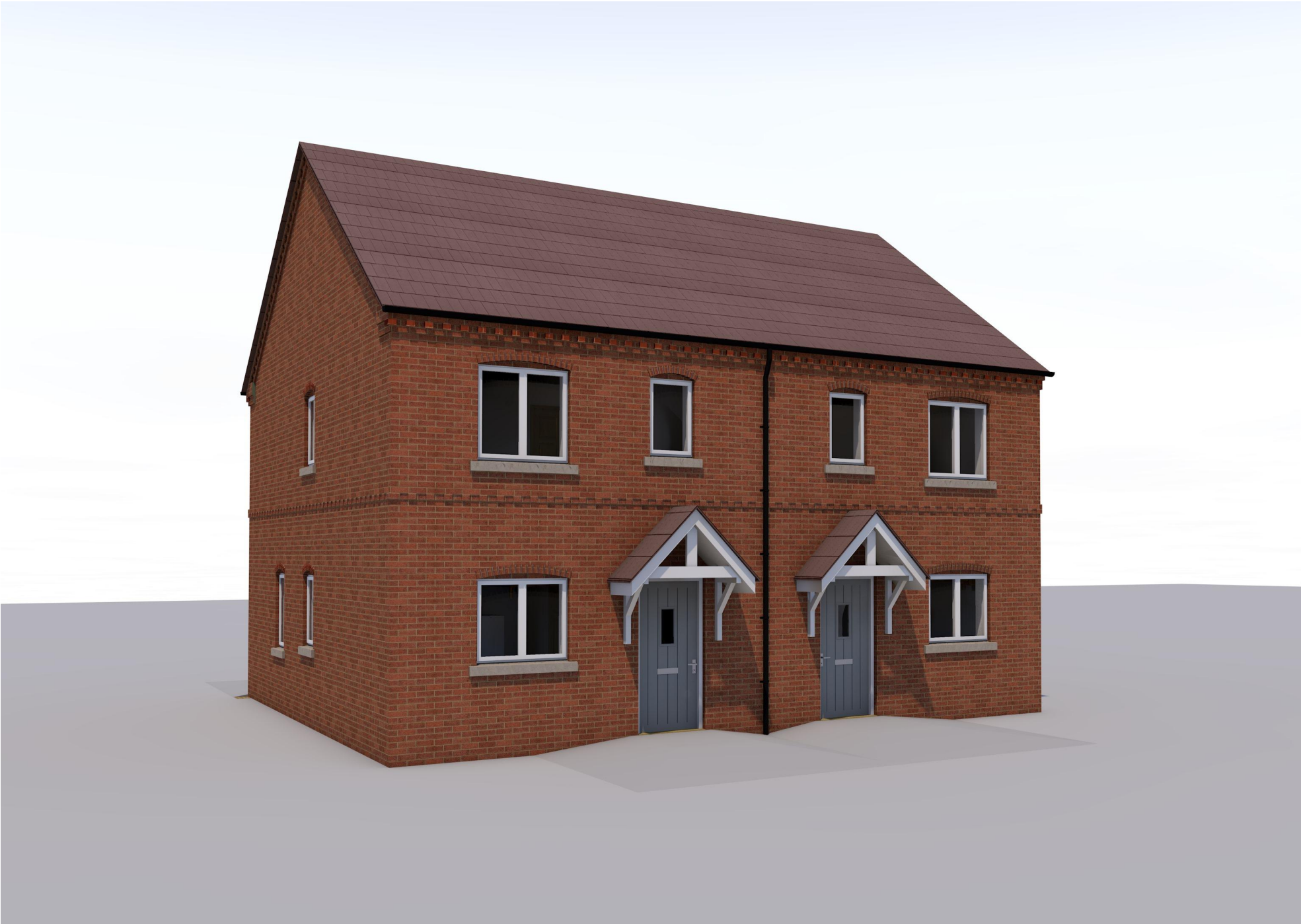
3 D VIEW