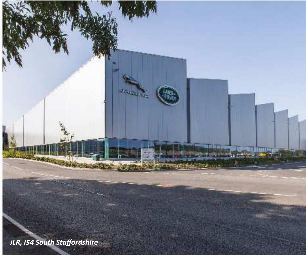
JLR, i54 South Staffordshire

South Staffordshire is located at the edge of the West Midlands conurbation, making it an area which attracts growth and investment. Making sure the level and location of that growth occurs in the most sustainable places is critical - and this is the role of the Local Plan review. Retaining the character and identity of the place, while ensuring our villages retain diversity and prosperity is a challenge which requires effective engagement with communities and businesses.