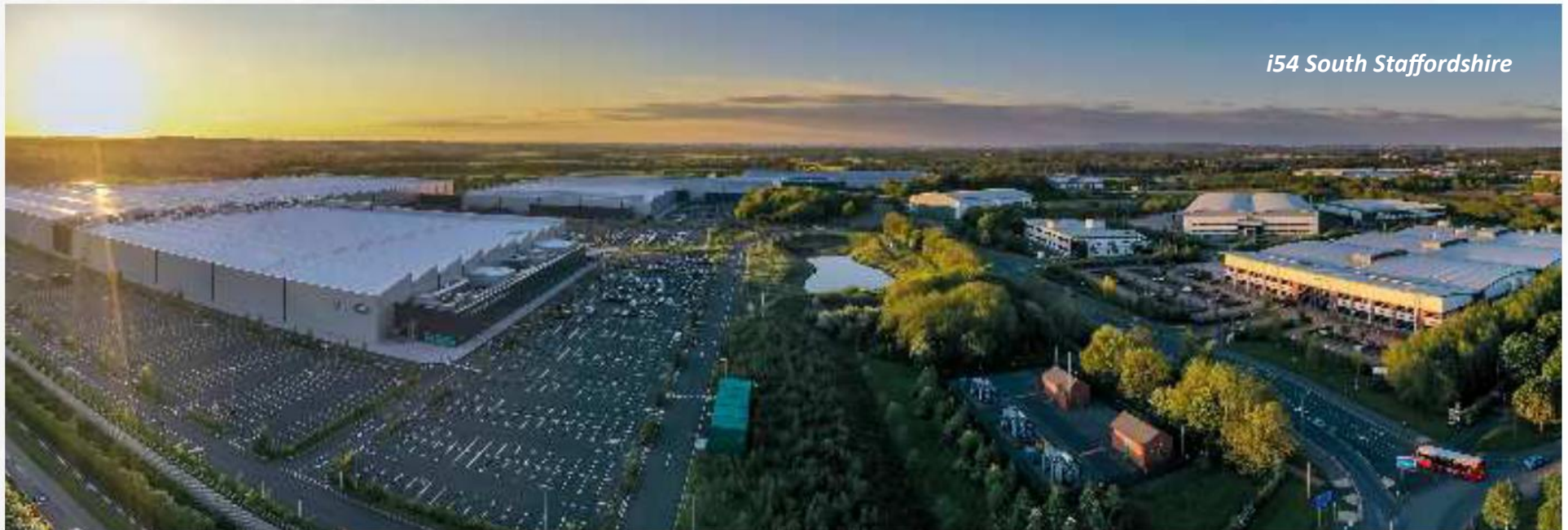
i54 South Staffordshire

Further to this, Logic54, at the former Royal Ordnance Factory site in Featherstone, will provide accommodation for a range of uses including industrial, storage, and distribution, accessed by a new motorway link road, creating 1,700 jobs.